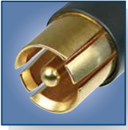
Gold plated contacts