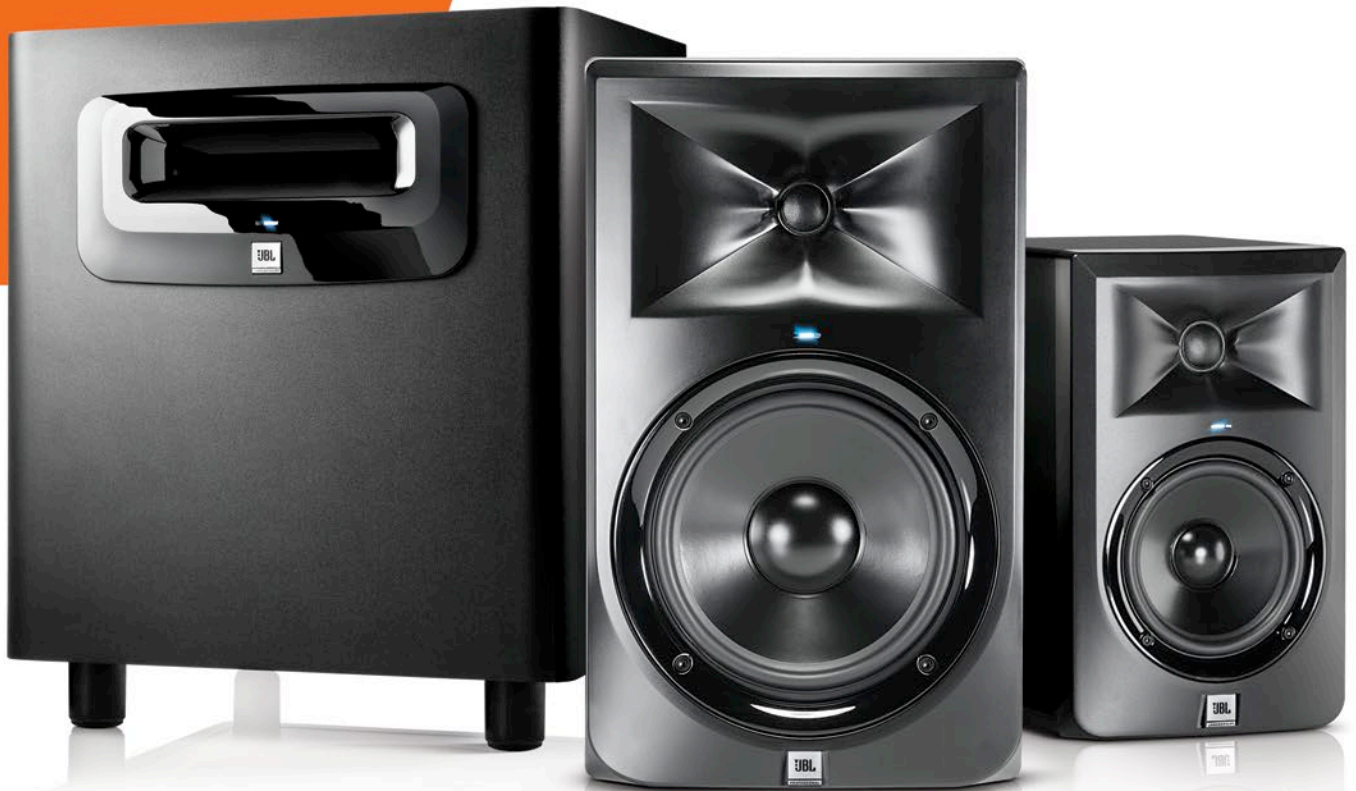
LSR310S POWERED 10" STUDIO SUBWOOFER

Introducing the 3 Series Powered Studio Monitors. The first to incorporate JBL's groundbreaking Image Control Waveguide, providing detail and depth like never before. Micro-dynamics in reverb tails, the subtleties of mic placement are clearly revealed. A realistic soundstage creates the tangible sense that there is a center channel speaker. 3 Series' broad, room-friendly sweet spot means everyone in the room hears the same level of dimension and transparency. With legendary JBL transducers, custom-designed power amplifiers, and the waveguide technology from our flagship M2 Master Reference Monitors, the surprisingly affordable 3 Series will boost the image in your studio.