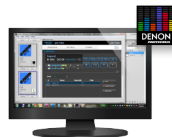
DN-700C Product Manager Software (included)

Denon Professional's Product Manager Software is included with the DN-700R for single point control of multiple players from a PC/Mac over the network. Complete with full access to the Web Remote as well as unique power on/off capabilities that allow power on and power off sequences to be programmed remotely for single units or multiple units in groups.