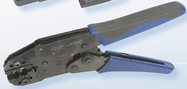
TC-1 Hand Crimp Tool Low cost, lightweight yet rugged, holds: